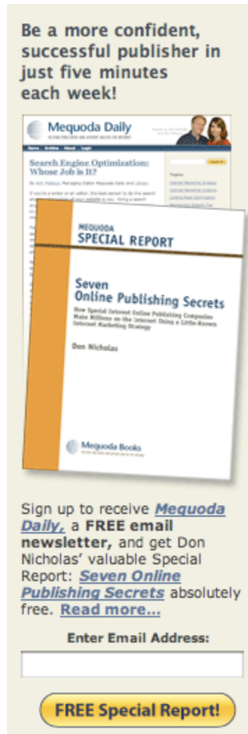
Example of Mequoda Books OFIN

Similar in concept to OFIEs , an OFIN is an "Order Form in Navigation". While they are usually smaller in size than OFIEs, their strategic intent is the same: to quickly capture your visitor's name and email address in order to grant them access to a free special report or a free copy of your magazine or newsletter. The ultimate goal for you as the website publisher is to quickly and easily add your unknown site visitors to your email database. Using OFIEs, OFINs and floaters on your website are relatively simple ways to improve the conversion architecture across your website network.