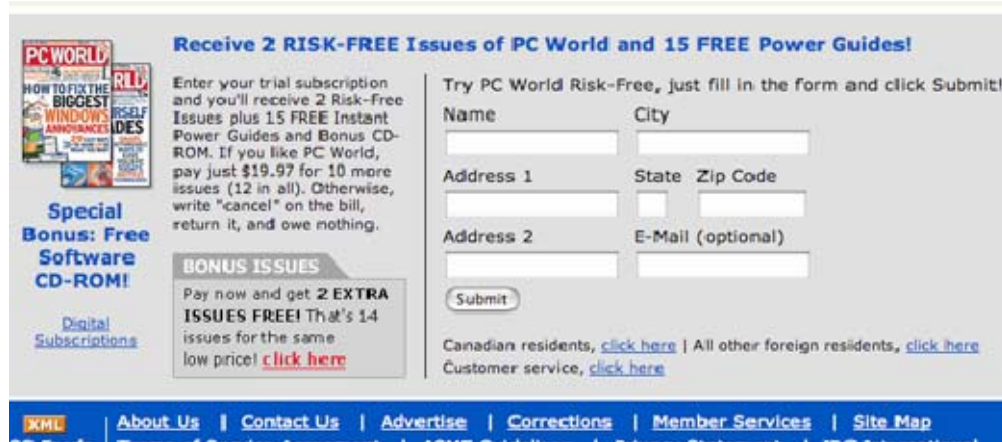
Example of PCWorld OFIE

Affectionately called OFIEs, "Order Forms in Editorial" are embedded subscription forms that appear on webpages and, indeed, are very much entitled to the respect, consideration, and perhaps even affection of circulators. They are fairly large, coupon-style ads, usually placed in unused space at the bottom of webpages and simply require a user to supply his or her name and address and click "submit". When used to generate subscriptions to a companion print magazine or newsletter, OFIEs can churn hundreds or thousands of new orders per year at virtually no cost. The key to OFIE effectiveness is prominent, relevant placement as close to the editorial content as possible.